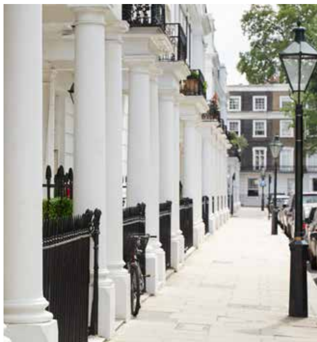
Wealth inequality is double that of income inequality in the UK.

Wealth in the UK is primarily made up of pensions and property, with smaller amounts represented by financial assets, art and other physical objects. 18 The UK's approach to taxing this wealth is a muddle. Our system of property taxation is broken, with tax rates only loosely tied to property values, which have risen rapidly and unevenly over the last few decades. Despite the fact that wealth inequality is double that of income inequality, the various taxes on income from wealth are generally lower than those on income from work. 19