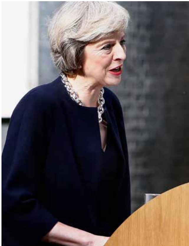
On taking office Prime Minister Theresa May promised to 'make Britain a country that works for everyone.'

We believe that the question of how to increase health funding should be just the start of a broader debate about the level of public services we want and how to pay for them. Tax Justice UK's vision is for a society where, because there is sufficient investment in public services, people do not have to wait months for desperately needed operations, where schools have enough resources to teach children properly, where people have access to affordable housing, and where elderly and vulnerable citizens are properly cared for. 3