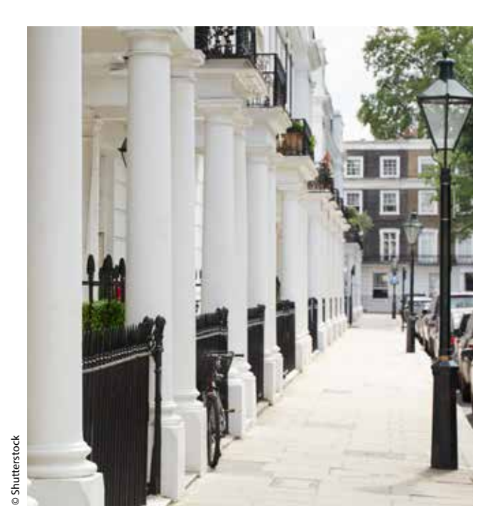
Wealth inequality is double that of income inequality in the UK.

Wealth in the UK is primarily made up of pensions and property, with smaller amounts represented by financial assets, art and other physical objects. The UK's approach to taxing this wealth is a muddle. Our system of property taxation is broken, with tax rates only loosely tied to property values, which have risen rapidly and unevenly over the last few decades. Despite the fact that wealth inequality is double that of income inequality, the various taxes on income from wealth are generally lower than those on income from work. 19