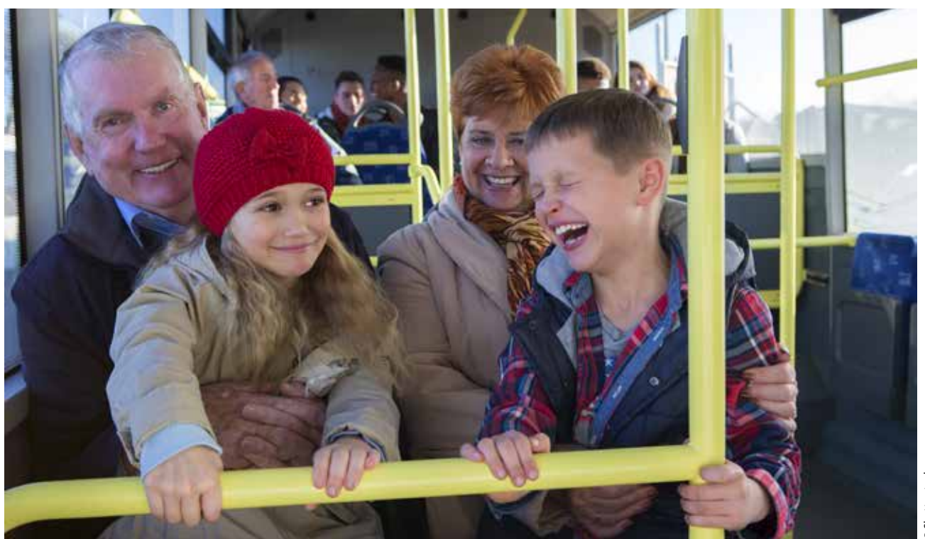
The tax system in the UK needs to change to make society more equal and support quality public services for all.

Decisions on how to change the tax system are never easy. However, the government has a real opportunity in the upcoming budget to move in a fairer direction, shifting the tax system towards taxing wealth, over work. The reforms we have outlined in this paper are necessary to rebalance our tax system, make our society more equal, and help to keep the level and quality of public services we need and want.